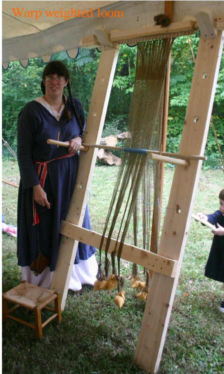
Warp weighted loom

If I have to stay at home and tend the farmstead when my husband goes out to sea, the very least he can do is send me home a package in the Spring when it warms up. This last time I sent him with a small piece of fabric to wrap my package in. He had better send me something good or he can sleep in the barn.