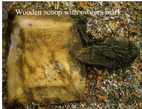
Wooden scoop with owners mark