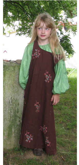
Sloppy shoulder problem, age 4 years almost 5