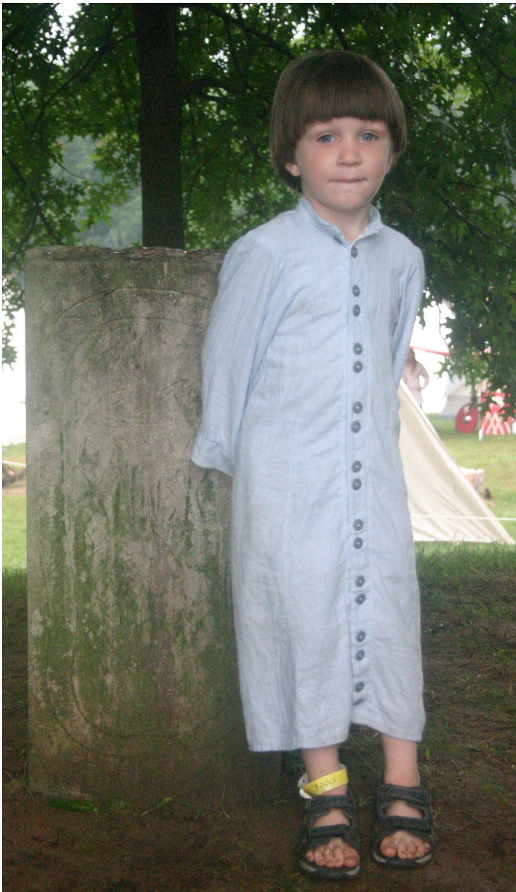
Every year we take a family picture at the Pennsic rune stone. This is my oldest son at age 4