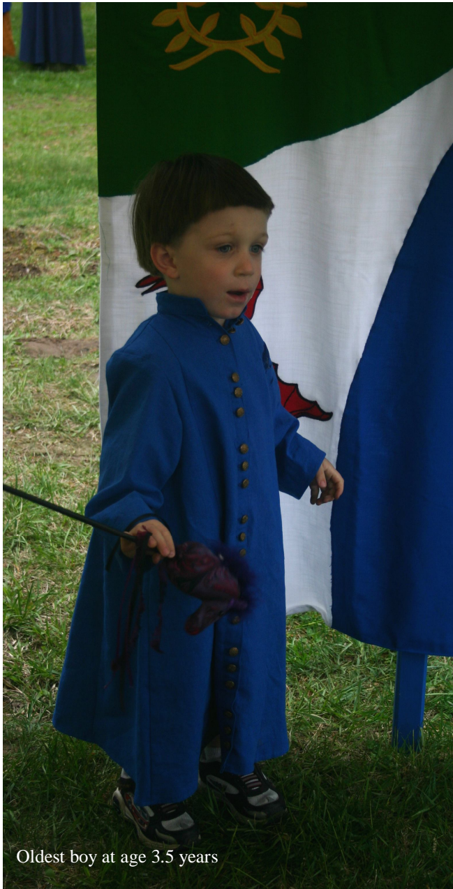
Oldest boy at age 3.5 years