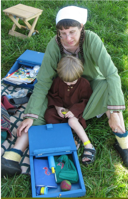
Girdle books and scribal boxes are court only toys. They are freshly restocked with stickers and crayons before every court.