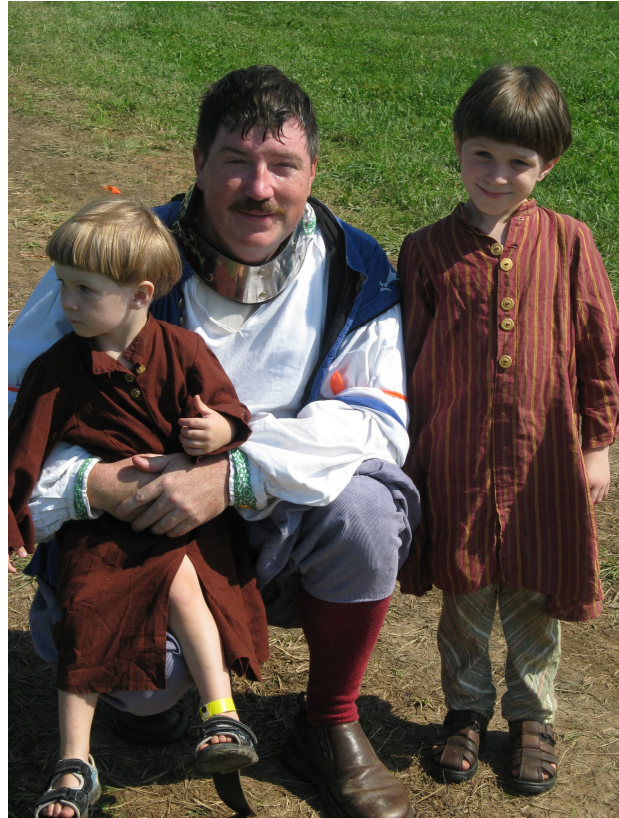
Pants or no pants, that is the question...