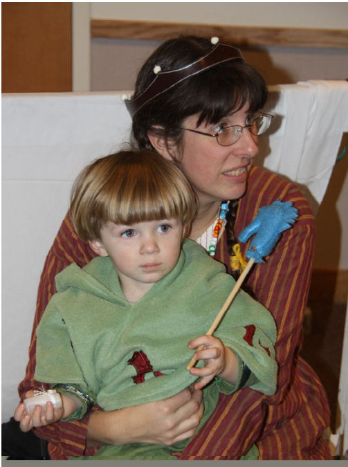
Heraldic polar fleece hoods are great!