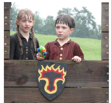
Do not be upset when clothes are abused. Water battle at Pennsic