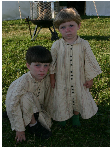
Enjoy matching outfits while they last.