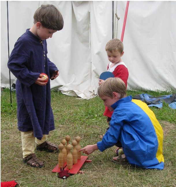
The best toy box at an event will attract friends.