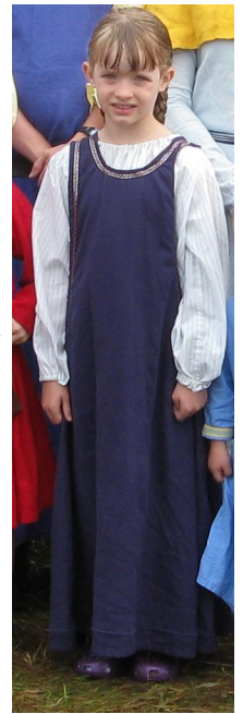
Friend's daughter age 5, almost