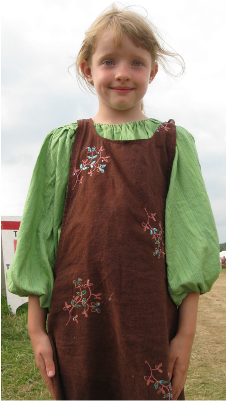
Friend's daughter at age 5, almost 6

Sideless surcoat from Dona Maria made from yellow silk, with vertical bands of gold thread, lined with rabbit fur. http://historiaviva.org/vestmenta/s13_maria_ajuar_en.shtml