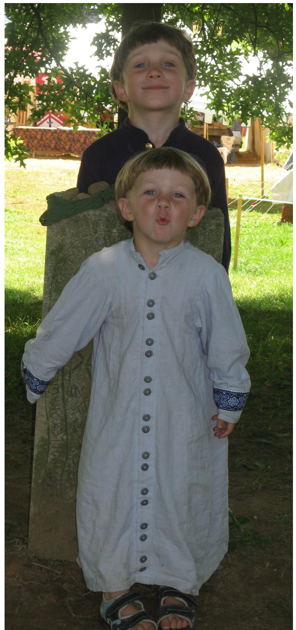
These are the boys at ages 3 and 5. Note the light blue G-63. It fit both boys at very different ages.